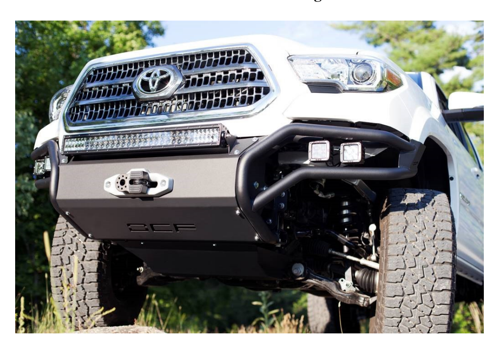
Congratulations! You're finished! We are sure that you will enjoy this Off Camber Fabrications product by MBRP Inc.