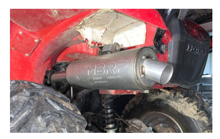
Congratulations! You are ready to begin experiencing the improved power, sound and driving experience of your MBRP performance exhaust system. We know you will enjoy your purchase.

If a quieter tone is desired contact your local dealer to purchase T14373.