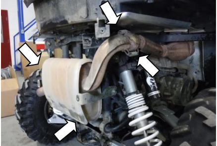
Refer to Figure 4.

3. Secure the inlet using the previously removed stock springs. Do the lower first, hooking it into the tab on the Y-Pipe, then onto the vehicle loop. Hook the upper spring onto the vehicle first then pull back and hook into the tab on the Y-pipe.