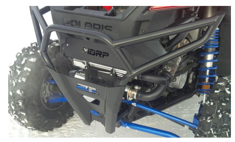
Congratulations! You are ready to begin experiencing the improved performance and driving excitement of your MBRP Exhaust upgrade. We know you will enjoy your purchase.

It is recommended that the muffler screws be retightened after the first ride and checked periodically thereafter, tightening if necessary.