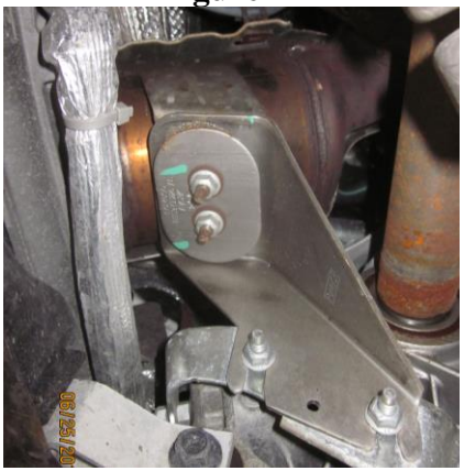
Figure 5 FG012 / CFG013 © 11/18