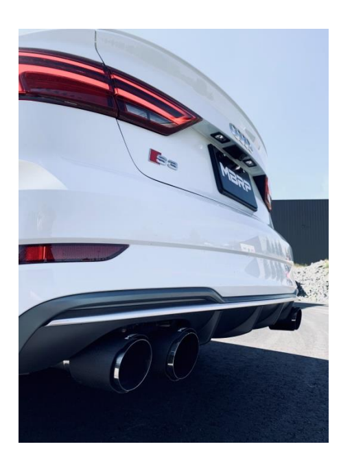
Congratulations! You are ready to begin experiencing the improved power, sound and driving experience of your MERP Performance Exhaust. We know you will enjoy your purchase!