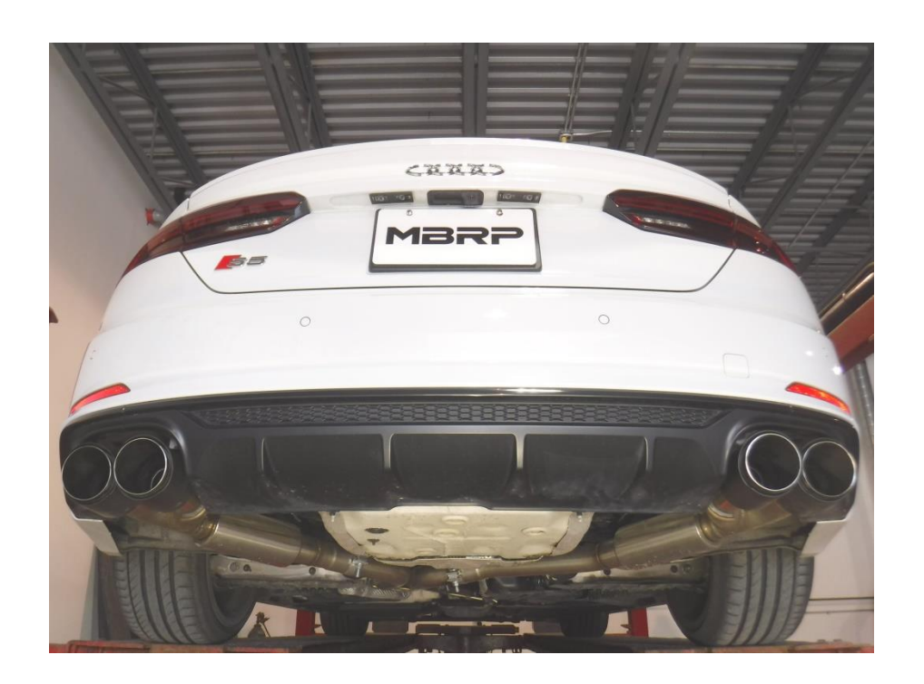
Congratulations! You are ready to begin experiencing the improved power, sound and driving experience of your MBRP performance exhaust system. We know you will enjoy your purchase.