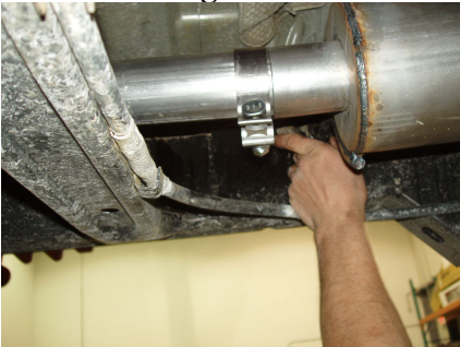
Figure 5 $5053 © 06/09