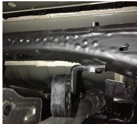
though the Bolt Spacer and the oval hole in the frame side (Arrow Figure 7) and oval hole in the bottom of the frame. Pull the M10 Carriage Bolt threads through the oval hole in the bottom of the frame. Install the remaining Hanger Assembly onto the M10 Carriage Bolt using the M10 Flat Washer , M10 Lock Washer and M10 Hex Nut . Refer to Figure 7 .

6. Thread the M10 Carriage Bolt into the Bolt Leader. Fish the Bolt Leader