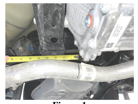
Figure 1 Driver-Side