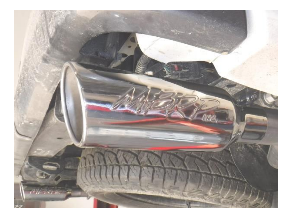
Congratulations! You are ready to begin experiencing the improved power, sound and driving experience of your MBRP Performance Exhaust. We know you will enjoy your purchase!

10. Tighten all hardware and clamps, starting at the front and working rearward to secure the system. Check along the full length of the exhaust system to ensure there is adequate clearance for fuel lines, vent lines, brake lines, frame, bodywork, suspension and any wiring, etc. If there is any interference detected, relocate or adjust to provide adequate clearance. Ensure all clamp connections are secure and components are unable to rotate or slide. Band clamps require approximately 45 lb-ft (60 N-m) of torque. Verify clearances, system security and band clamp torque after 30-60 miles (50-100 km) of driving.