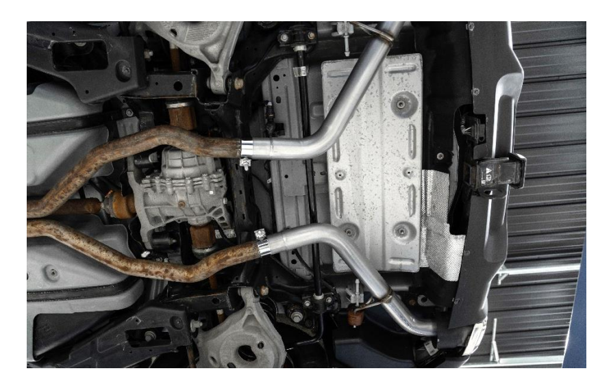
Congratulations! You are ready to begin experiencing the improved power, sound and driving experience of your MBRP Performance Exhaust. We know you will enjoy your purchase!

2. Carefully align the system. Align the edge of each band clamp with the edge of the joint it is connecting. Tighten all hardware and clamps, starting at the front and working rearward to secure the system. Check along the full length of the exhaust system to ensure there is adequate clearance for fuel lines, vent lines, brake lines, frame, bodywork, suspension and any wiring, etc. If there is any interference detected, relocate or adjust to provide adequate clearance. Ensure all clamp connections are secure and components are unable to rotate or slide. Band clamps require approximately 45 lb-ft (60 N-m) of torque. Verify clearances, system security and band clamp torque after 30-60 miles (50-100 km) of driving.