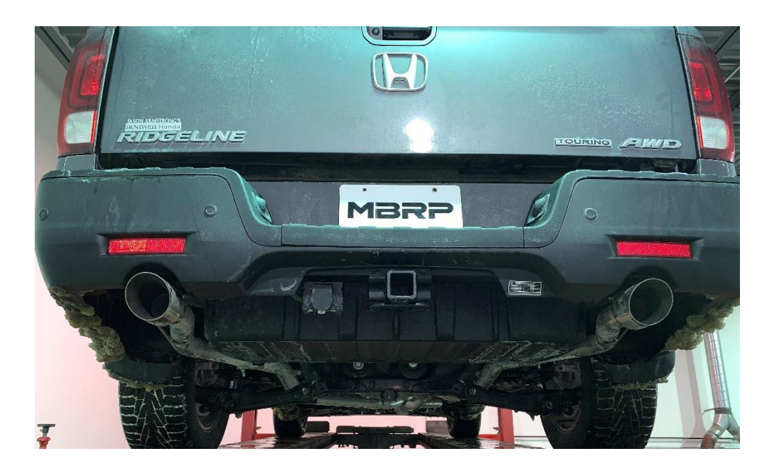
Congratulations! You are ready to begin experiencing the improved power, sound and driving experience of your MBRP Performance Exhaust. We know you will enjoy your purchase!