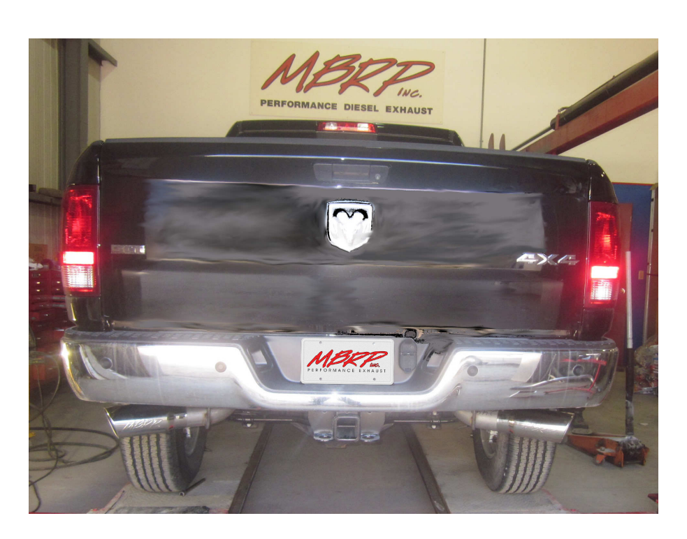
Congratulations! You are ready to begin experiencing the improved power, sound and driving experience of your MBRP performance exhaust system. We know you will enjoy your purchase.

12. Check along the whole length of the exhaust system to ensure that there is adequate clearance around the spare tire, fuel and brake lines or any wiring. If any interference is detected relocate or adjust. Pay particular attention to the brake flex lines and ABS wiring on the driver's side. Most often these can be kept clear of the exhaust by loosely tying them back to the emergency brake cable. Different configurations may require different methods. It is the installer's responsibility to ensure there is enough clearance to prevent damage.