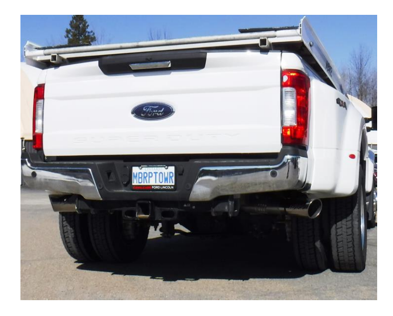
Congratulations! You are ready to begin experiencing the improved power, sound and driving experience of your MBRP performance exhaust system. We know you will enjoy your purchase.

13. Align the edge of each band clamp with the edge of the joint it is connecting. Tighten all hardware and clamps, starting at the front and working rearward to secure the system. Check along the full length of the exhaust system to ensure there is adequate clearance for fuel lines, vent lines, brake lines, frame, bodywork, suspension, and any wiring, etc. If there is any interference detected, relocate, or adjust to provide adequate clearance. Ensure all clamp connections are secure and components are unable to rotate or slide. Band clamps require approximately 45 lb-ft (60 N-m) of torque. Verify clearances, system security and band clamp torque after 30- 60 miles (50-100 km) of driving. It is the installer's responsibility to ensure there is enough clearance to prevent damage.