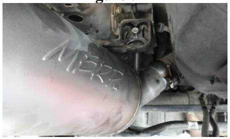
Figure 6 $7225 © 10/20