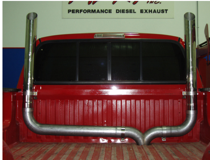
Shown with 4" x 36" Stacks (B1410)

Congratulations! You are ready to begin experiencing the improved power, sound and driving excitement of your MBRP Inc. "Smokers" . We are certain you will enjoy your purchase.