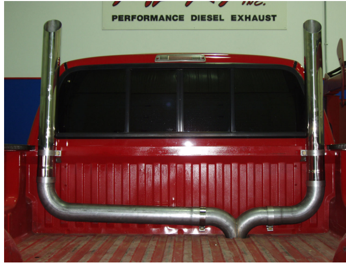
Shown with 4" x 36" Stacks (B1410)

Congratulations! You are ready to begin experiencing the improved power, sound and driving excitement of your MBRP Inc. "Smokers™" . We are certain you will enjoy your purchase.