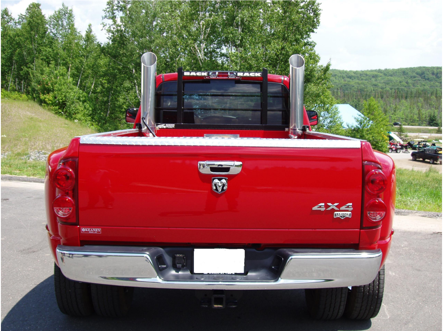
Shown with 6" X 36" Stacks (B1610) and Cover (BB0002)

Congratulations! You are ready to begin enjoying the improved performance and driving experience of your MBRP Inc. "Smokers™". We hope you enjoy your purchase.