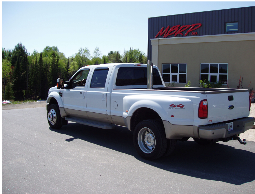
Shown with 6" x 36" Stack (B1610)

Congratulations! You are ready to begin experiencing the improved power, sound and driving excitement of your MBRP Inc. "Smokers™". We are certain that you will enjoy your purchase.