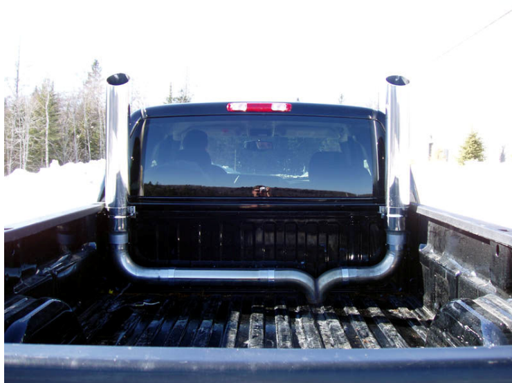
Shown with 6" Stacks

16. Install remaining Clamps around pipes where required. Check along the whole length of the exhaust system to ensure that there is adequate clearance around the fuel and brake lines or any wiring. If any interference is detected relocate or adjust.