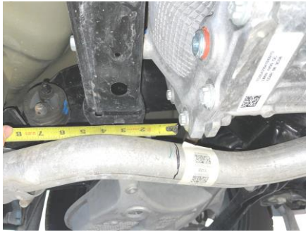
Figure 1 Driver-Side