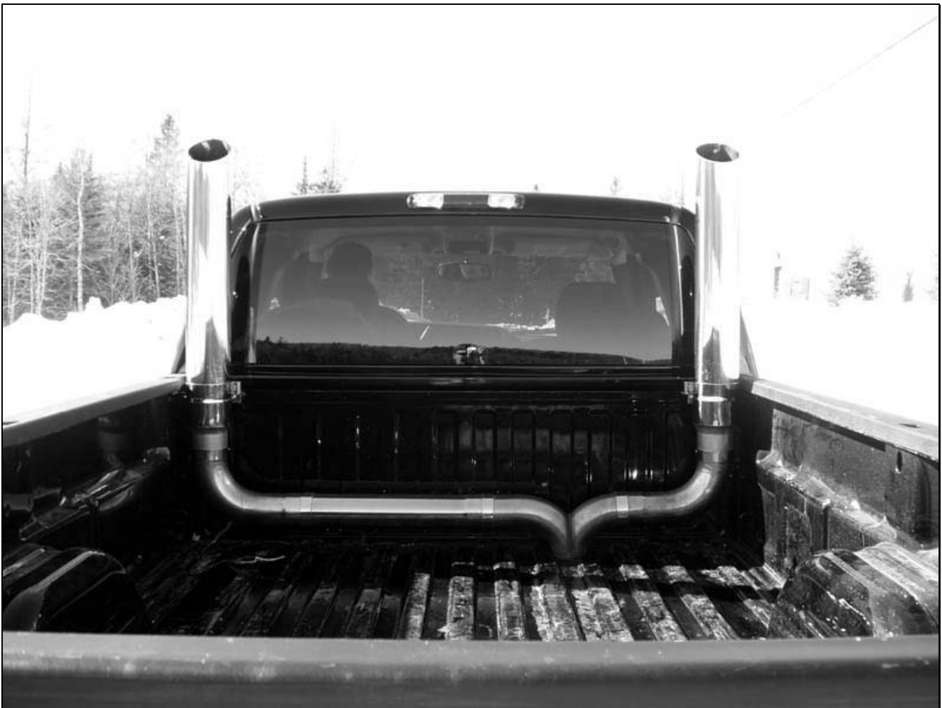
Shown with 5” X 36” Angle Cut Stacks (B1530)

Congratulations! You are ready to begin enjoying the improved performance and driving experience of your MBRP Inc. “Smokers”™ . We hope you enjoy your purchase.