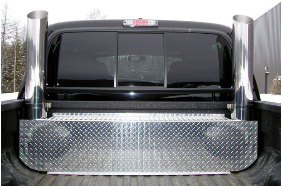
Shown with Checker Plate BB0001

Congratulations! You are ready to begin experiencing the improved power, sound and driving excitement of your MBRP Inc. performance exhaust system. We know you will enjoy your purchase.